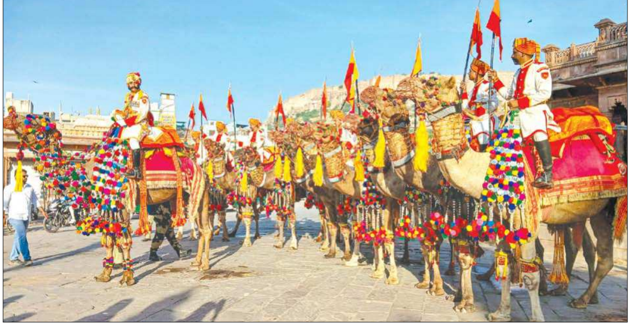
Border Security Force personnel mounted on camels take part in the Marwar Festival celebration, in Jodhpur, on Wednesday