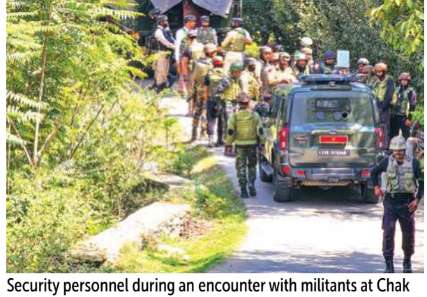
Tapper Kreeri Pattan area, in Baramulla district, Jammu and Kashmir, on Saturday

specific intelligence from Tapar/Watargam," he said, intelligence agencies about adding that a cordon was the presence of some uniestablished at the suspectdentified terrorists in Chak ed location.