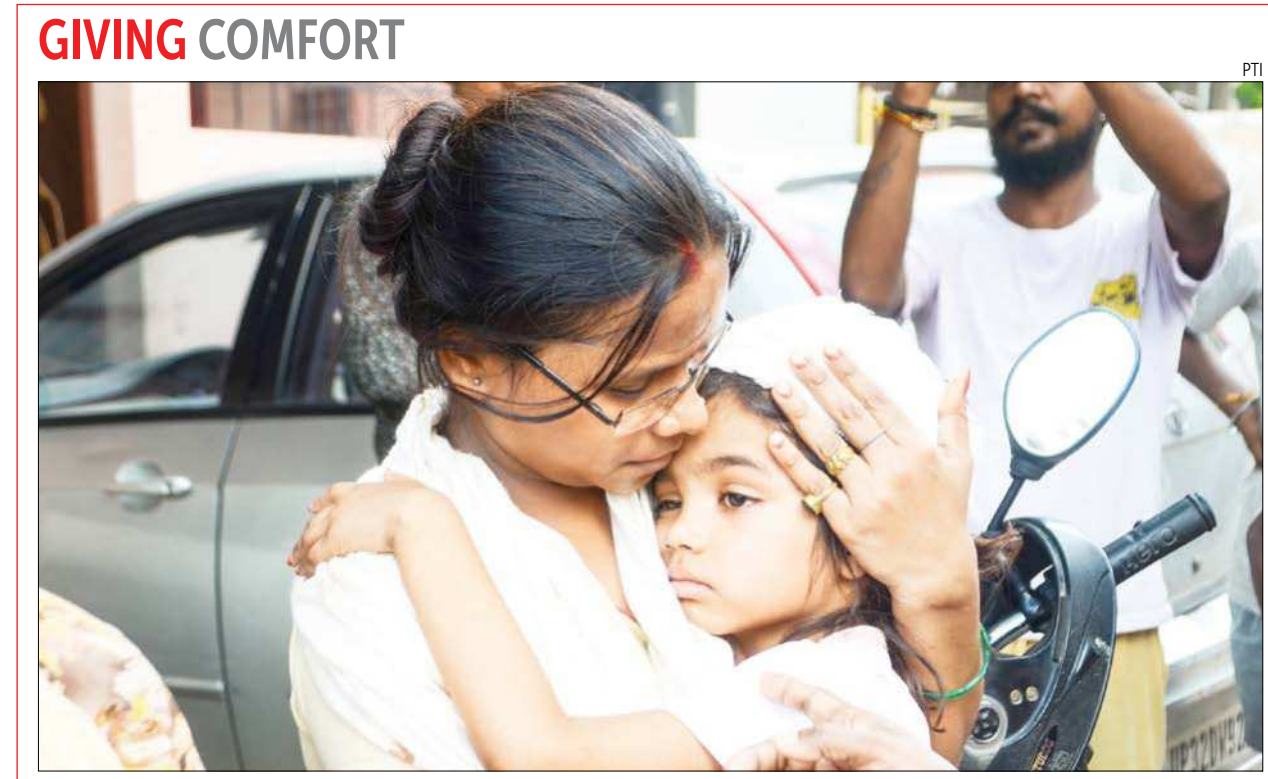
A woman holds a girl who suffered head injuries due to landslides while returning after visiting Maa Vaishno Devi shrine, in Kanpur, Uttar Pradesh, on Tuesday

(CTP) be directed to immediately inspect the properties at Morjim where huge strata of land has been converted from Orchard to Settlement and to submit the report to the Court. They stated that de-