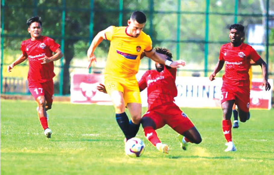
Churchill Brothers and Gokulam Kerala FC in a tussle for the ball at Raia ground, on Friday