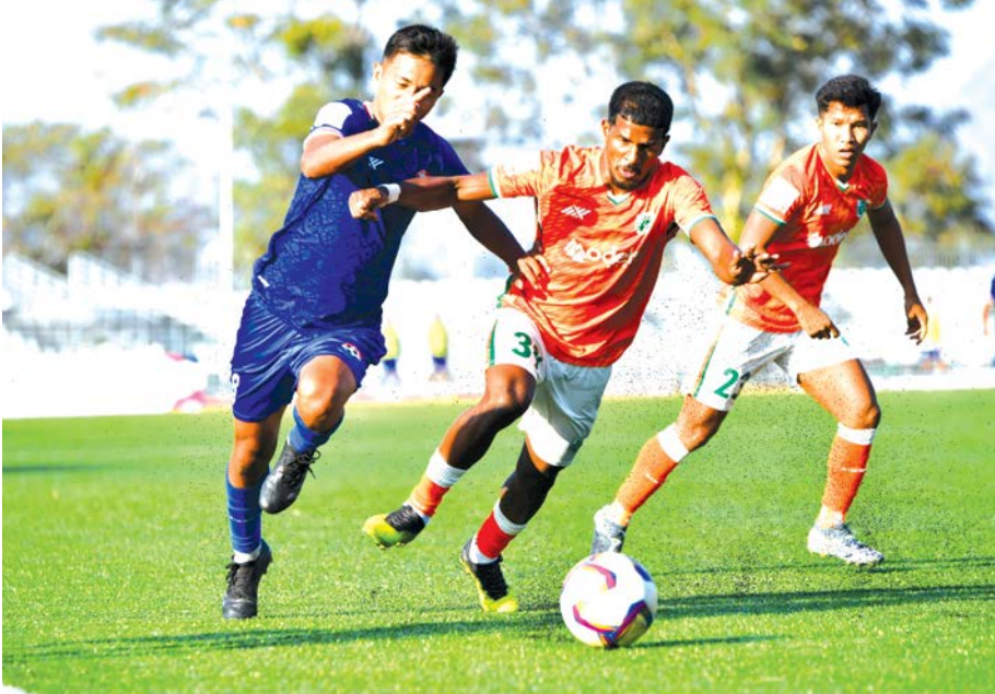
Sporting Clube de Goa and Chanmari FC players try to overpower each other to take control of the ball at the Rajiv Gandhi Stadium in Aizawl, Mizoram, on Friday