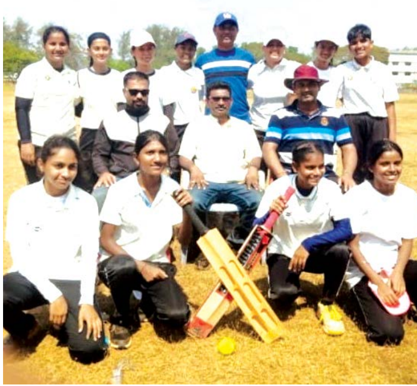
Our Lady of the Rosary High School, Dona Paula, won the Taluka Level U-14 and U-17 Girls Tennis Ball Cricket Tournaments organised by the Directorate of Sports and Youth Affairs, Campal-Panjim, recently. The Our Lady of the Rosary High School now have qualified to play at the District Level. The teams along with the officials