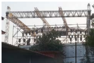
The huge stage built for the controversial party

VAGATOR: Fed up with the relentless sound pollution close to their homes, locals from Anjuna and Vagator have threatened to take out a candlelight march outside the venue of Circus X Namas' Cray if the Supreme Court guidelines are not followed on the party