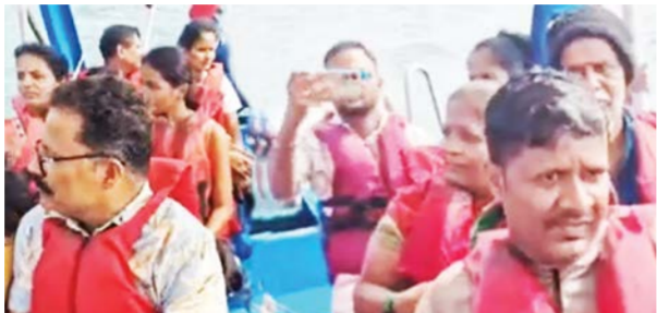
Passengers on the boat some time before it sank on Wednesday