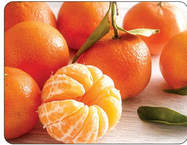
BEST FRUITS AND VEGETABLES TO FIGHT THE COLD WINTER