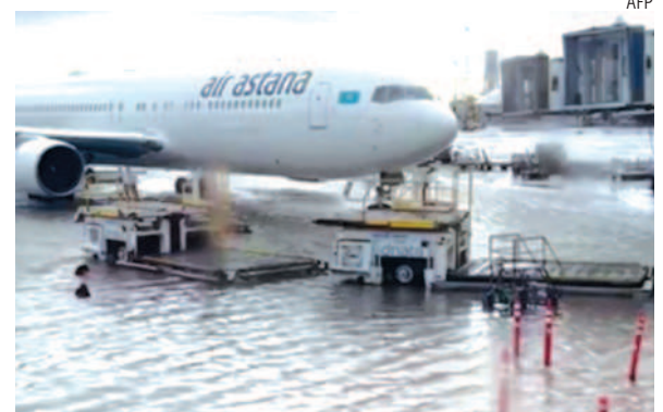
Flydubai flights has cancelled all flights departing Dubai

"I can understand that the country can't deal with rain on this scale, but the lack of transparency and real-time