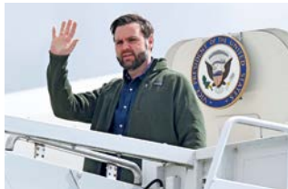
US VP J D Vance stops at Ramstein Air Base, Germany to refuel while en route to Joint Base Andrews, Maryland