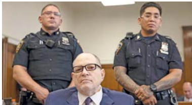
Harvey Weinstein appears for his retrial in Manhattan Criminal Court, in New York