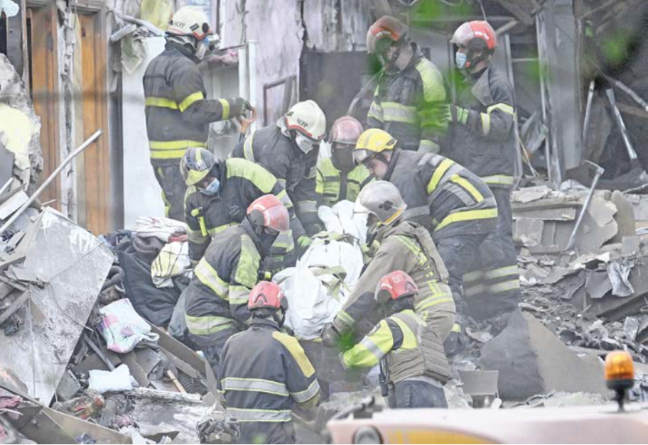
Ukrainian rescuers carry the body of a victim as they operate at the site of a Russian missile attack in Kyiv on Thursday, amid the Russian invasion of Ukraine

Trump, who has long been reluctant to criticise the Kremlin, said he was "not happy" with it. He implored Russian President Vladimir Putin, to cease the