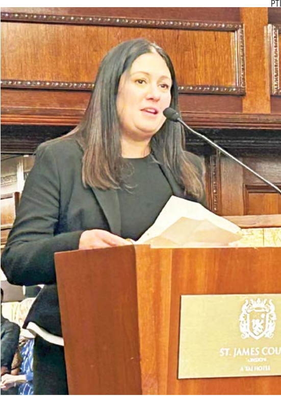
UK Secretary of State for Culture, Media and Sport Lisa Nandy speaks at a reception celebrating the India-UK cultural partnership, in London, on Wednesday evening