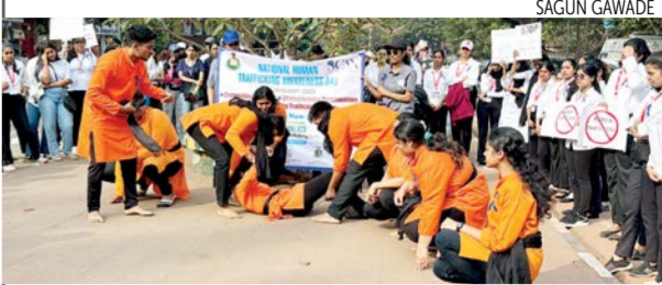
Street play by students on human trafficking

PANJIM: Stop Child Abuse Now (SCAN-Goa), in collaboration with the Goa Police, Women Police Station, and the Anti-Human Trafficking Unit (AHTU) - Panaji, organised a rally on Saturday, to mark National Human Trafficking Awareness Day.