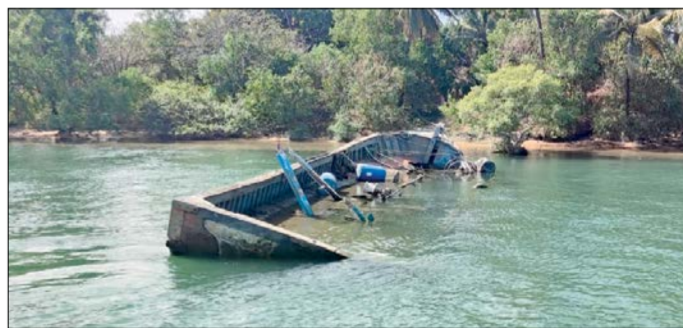
Fishing trawler that submerged in the middle of River Sal