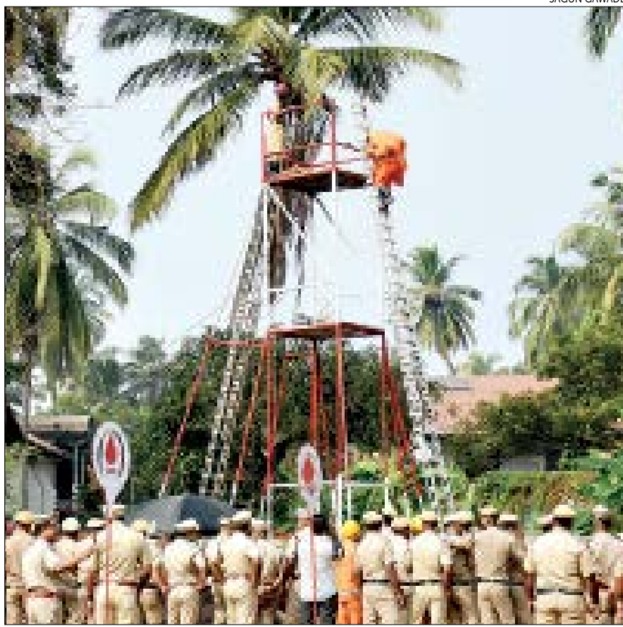
Fire personnel perform a drill at the Directorate of Fire and Emergency Services ground at St. Inez, Panjim, on Saturday