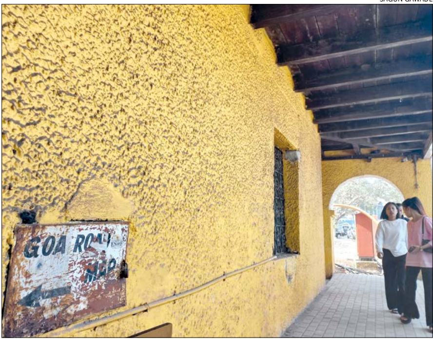
Layers of dust coat the walls of a historic building near the Head Post Office in Panjim