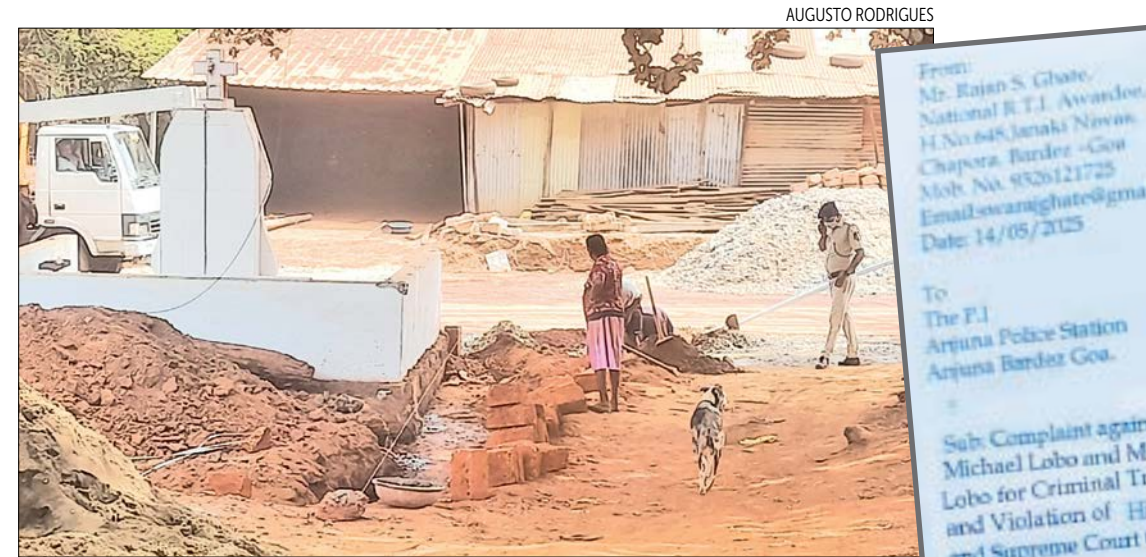
Anjuna Police are silent spectators as a cross is built without permission of owners of Survey No. 484

What is this going on? How can you decide to do what you want on my land without informing us? Please stop the work now