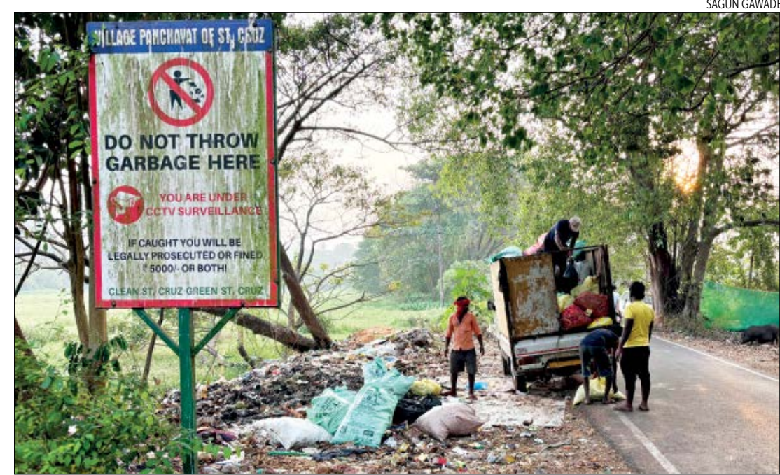
Workers employed by the Santa Cruz village panchayat collect garbage from the road side in the village. Despite a warning signboard, miscreants continue to dump garbage at the secluded spot