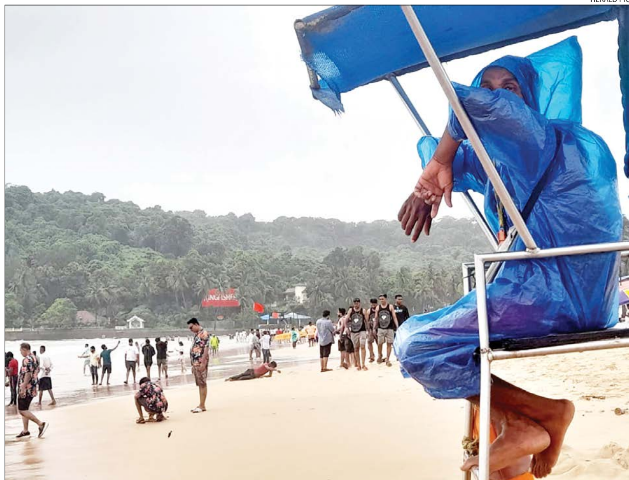
Even the gloomiest monsoon weather doesn't seem to dull Baga beach's appeal. On Thursday, despite lashing rain and gusty winds, domestic tourists flocked to the shore — many ignoring the ban on entering the water. A lifeguard, clad in a raincoat, kept watch from his chair to ensure compliance and prevent foolhardy behaviour