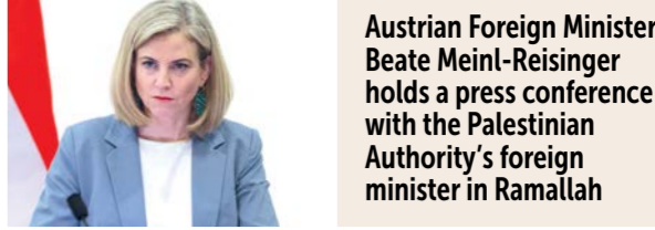
Austrian Foreign Minister Beate Meisl-Reisinger holds a press conference with the Palestinian Authority's foreign minister in Ramallah