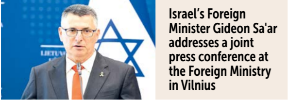
Israel's Foreign Minister Gideon Sa'ar addresses a joint press conference at the Foreign Ministry in Vilnius