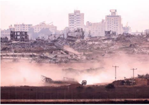
Gaza Strip after an Israeli strike on the besieged Palestinian territory

Two other strikes on a Gaza City street killed 15 people, according to Shifa Hospital, which received the casualties. A strike on a building killed six people near the town of Zawaida, according to Al-Aqsa hospital.