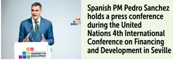
Spanish PM Pedro Sanchez holds a press conference during the United Nations 4th International Conference on Financing and Development in Seville