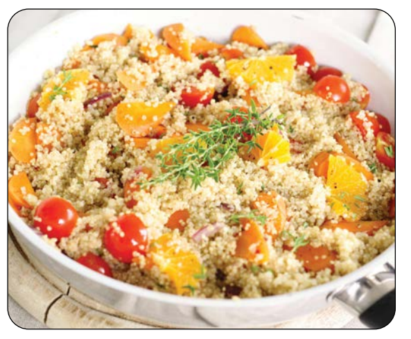
EATING WITH INTENT: GEN Z'S TASTE FOR CLIMATE-CONSCIOUS CUISINE