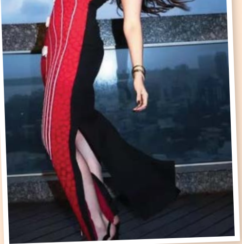
Actor Tamannaah Bhatia shared a series of images in a red and black long plunging neckline dress designed by globally-acclaimed designer brand Falguni Shane Peacock serving red hot drama.

The day concluded with a litany at 7:30 pm at St Peter's Chapel, followed by a community reception that brought everyone together once again in prayer and celebration.