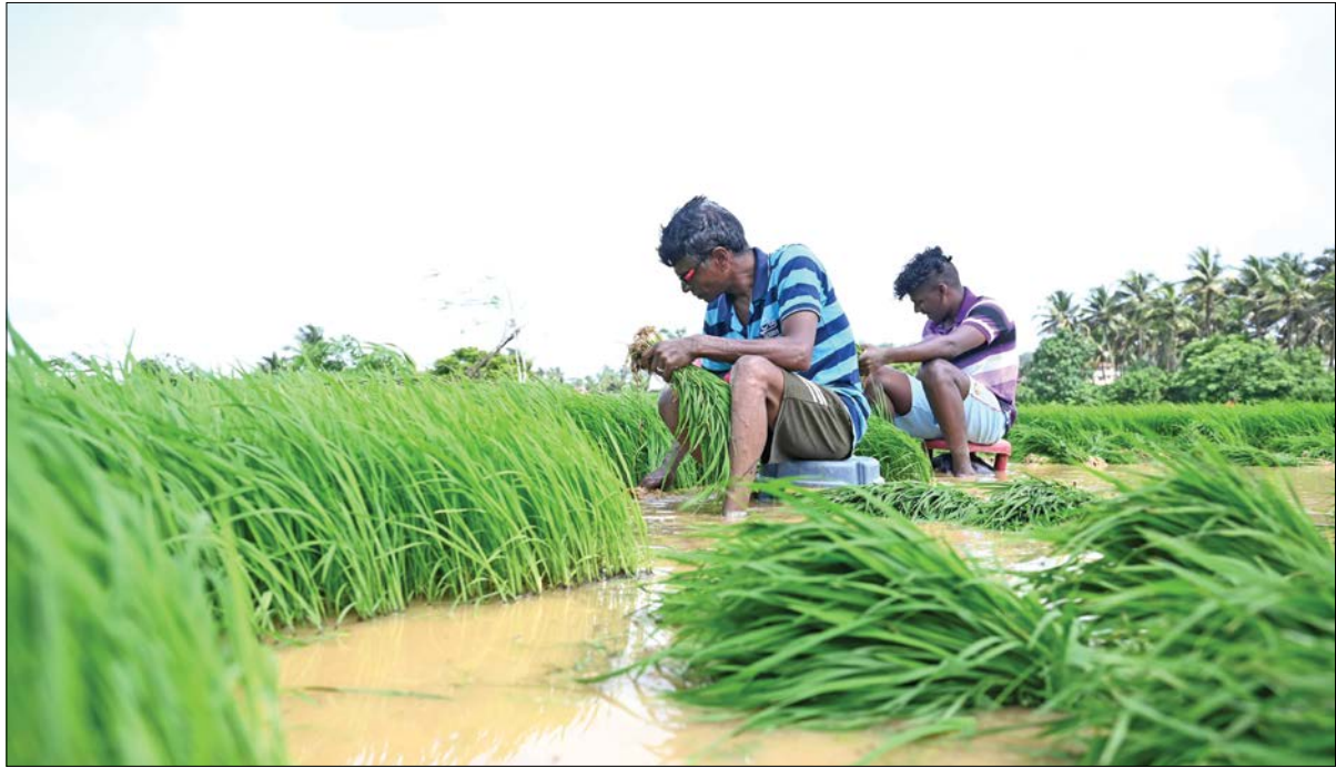
Farmers engaged in age-old traditional agricultural activity of planting paddy crop in a field at Fatorda