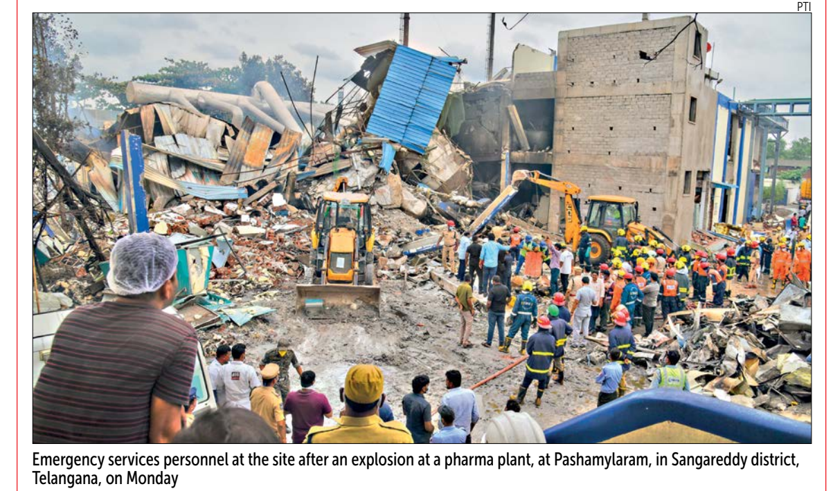
13 killed, 34 injured in Telangana pharma plant blast

Explosion triggered by suspected chemical reaction, rescue ops on; State govt forms 5-member probe panel