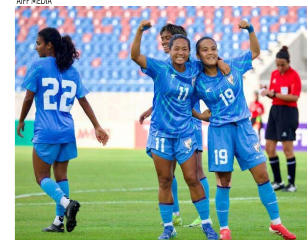
The India senior women's team celebrates victory against Timor-Leste at the 700th Anniversary Stadium in Chiang Mai on Sunday

Right from kick-off, India picked up from where they left off against Mongolia, applying pressure high up the pitch and creating opportunities with slick passing and energetic wing play.