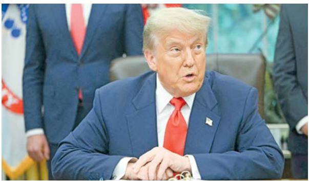
US President Donald Trump clears key US Senate vote ahead of July 4 deadline

"Senate Republicans are scrambling to pass a radical bill, released to the public in the dead of night, praying