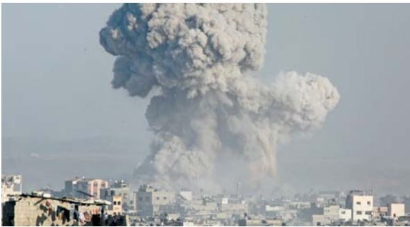
Smoke billows after an Israeli strike on Jabalia in the northern Gaza Strip

As international criticism mounted over civil-