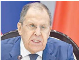
Russian Foreign Minister Sergei Lavrov speaks during a joint press conference with his Kyrgyz counterpart following their talks in Cholpon-Ata