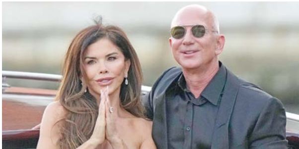
Lauren Sanchez Bezos and Jeff Bezos depart from the Aman hotel during wedding celebrations in Venice, Italy