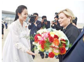
Russian Culture Minister Olga Lyubimova after her arrival with her delegation at the Pyongyang International Airport in Pyongyang