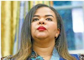
Democratic Republic of the Congo Foreign Minister Thérèse Kayikwamba Wagner during a meeting with US Prez Trump in Washington, DC