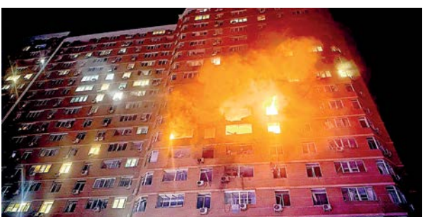
A fire in a multi-storey residential building following a Russian drone attack in Odesa