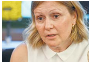
President of France's National Assembly Yael Braun-Pivet speaks to the media during a press conference in Shanghai, China