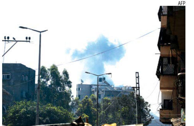
Smoke billows following Israeli strikes west of Jabalia in the norther Gaza Strip

Also among the dead were 12 people near the Palestine Stadium in Gaza City, which was sheltering displaced people, and to Al-Ahli Hospital. Anoth-