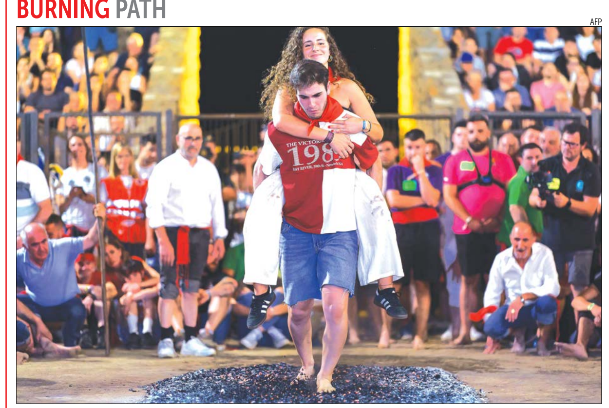
A reveller carries a girl on his back while walking on burning embers during the night of San Juan in San Pedro Manrigue, Soria province in northern Spain

Moscow also said it had captured another village in the Donetsk region, which the Kremlin has claimed as part of Russia since late 2022.