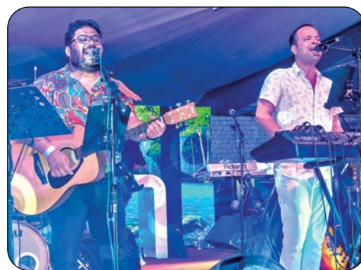
FESTA SÃO JOÃO 2025 CELEBRATED TENTH EDITION IN DUBAI