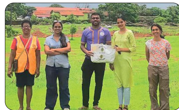
ALDONA CITIZENS ORGANISE SEED-THROWING DRIVE TO REVIVE GREEN COVER