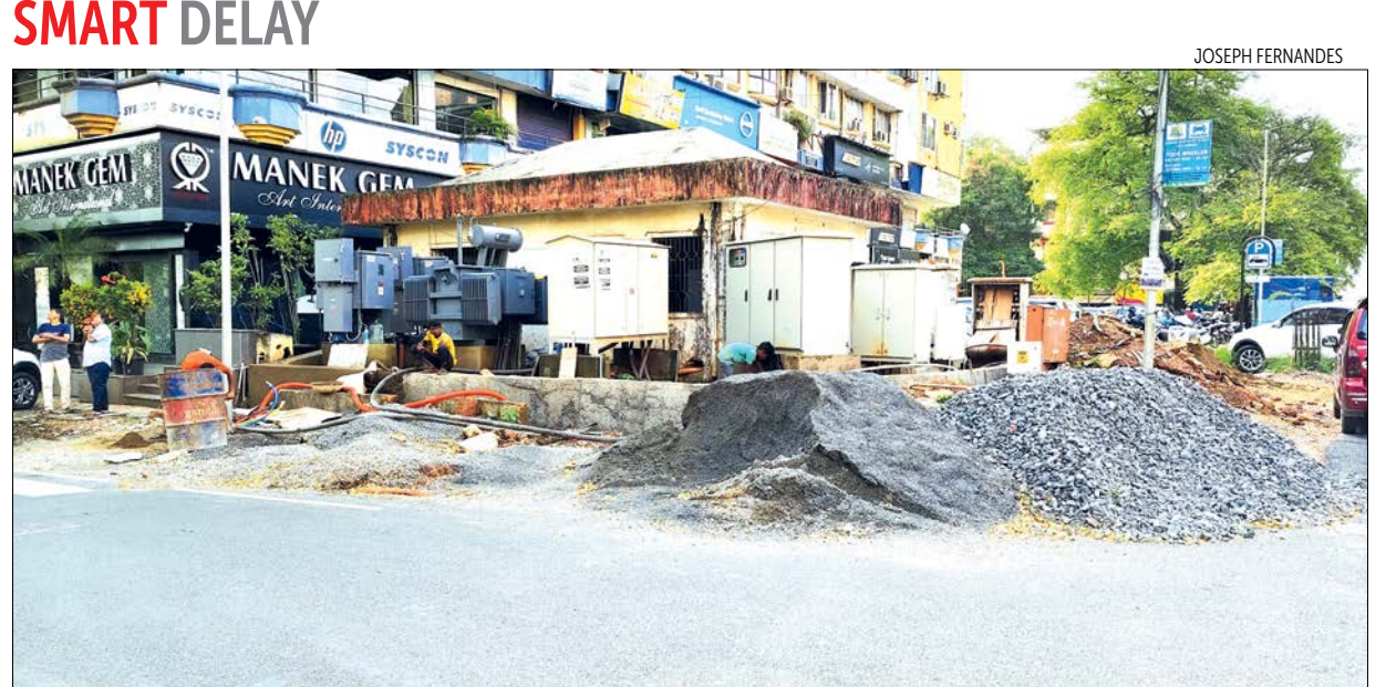
Workers continue plastering a wall in the rain near Don Bosco, Panjim, even after the Smart City project deadline has expired, as truckloads of sand and construction materials remain strewn along the roadside

cision to drop Gaude from the Cabinet was taken by Chief Minister Pramod Sawant, adding that Gaude should refrain from politicising the issue needlessly.