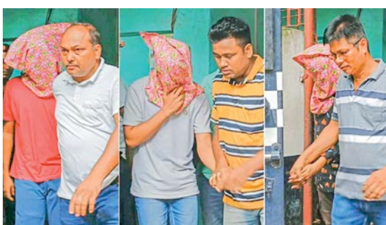
The accused who were arrested in connection with the alleged 'gang-rape' being produced at a city court in Kolkata, on Friday

PTI, KOLKATA: A 24-year-old first-year student of a law college in south Kolkata was gang-raped inside the institution allegedly by an alumnus and its two senior students, police said on Friday.