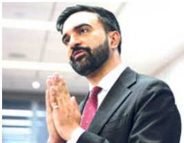
Assemblyman Zohran Mamdani talks to people at the John Jay College of Criminal Justice in the Gerald W. Lynch Theater