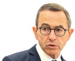
France's Minister for the Interior, Bruno Retailleau delivers a press conference at France's Ministry for the Interior, Place Beauvau in Paris