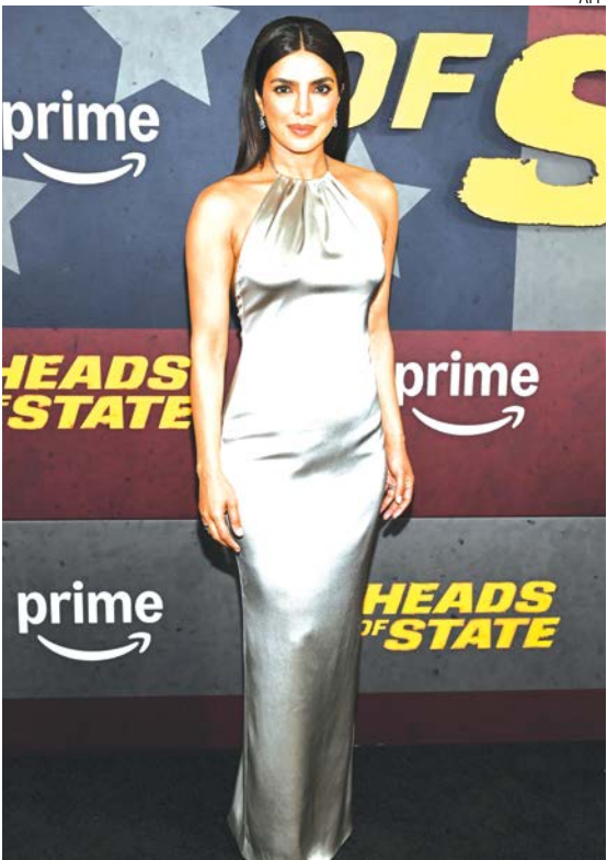
Priyanka Chopra Jonas attends the world premiere of "Heads of State" at Alice Tully Hall

LILLE: The theft of cables along train tracks in northern France on Wednesday disrupted Eurostar trips between London and Paris for a second day in a row, the company and French railway operator said. Overnight, "more than 600 metres (650 yards) of cable were stolen or severed south of the Lille Europe station" on the way between the two capitals, French railway operator SNCF said. "The impact is essentially on high-speed train traffic," it added. Around 15 workers, including cable layers, were dispatched to solve the issue, but repairs were expected to take a good part of the day, the operator added.