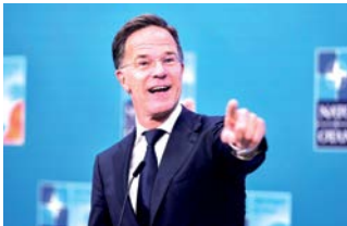
NATO Secretary General Mark Rutte speaks with the media as he arrives for the NATO summit in The Hague, Netherlands