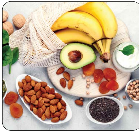
BALANCE YOUR SODIUM WITH THESE FOODS