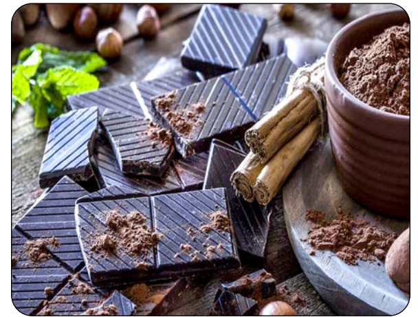
FIVE REASONS DARK CHOCOLATE BELONGS IN YOUR DAILY DIET