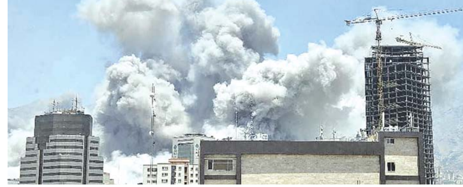
A plume of smoke billowing after Israeli strikes in Tehran the same day. Israel said it struck Iran Revolutionary Guards sites in Tehran and the city's notorious Evin prison

The strikes also hit Tehran's Palestine Square and other "military command