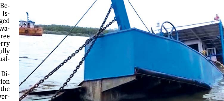
One of the three motorbikes that was partially submerged along with the ferry (left) at the Chorao ramp being successfully recovered

As per the standard operating procedure (SOP), the tank is to be checked regularly. Prima facie, it appears that already there was water in the boat and it was not cleared. It was not cleared for at least two days. With heavy rains, more water entered the boat and it sank