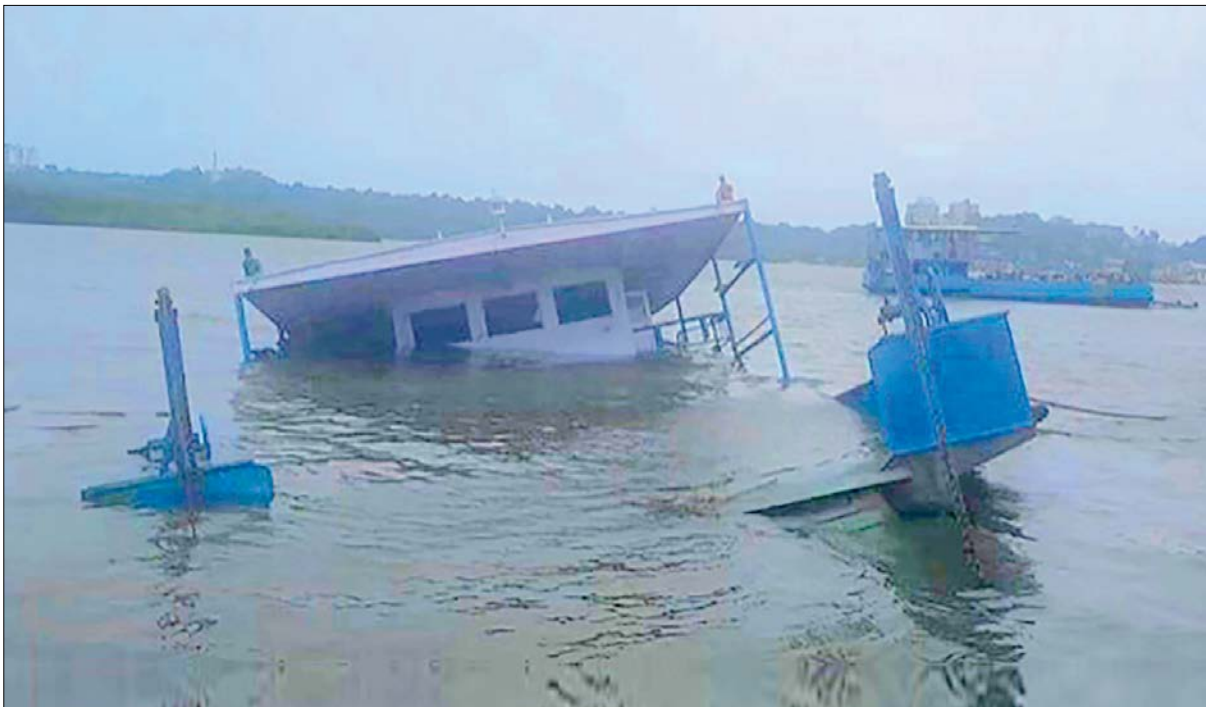
The ferry 'Betim' seen partially submerged and listing to one side at Chorao island on Monday, after a leak in one of its tanks was left unattended. While no casualties were reported, three submerged motorcycles were later recovered