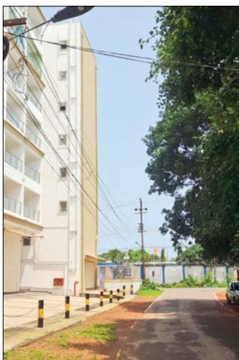
A ground +7 building just 20 metres away from the airport boundary at Dabolim with no NOC

In DGCA's final order dated August 11, 2023, addressed to the commanding officer of INS Hansa, Dabolim Airport, the