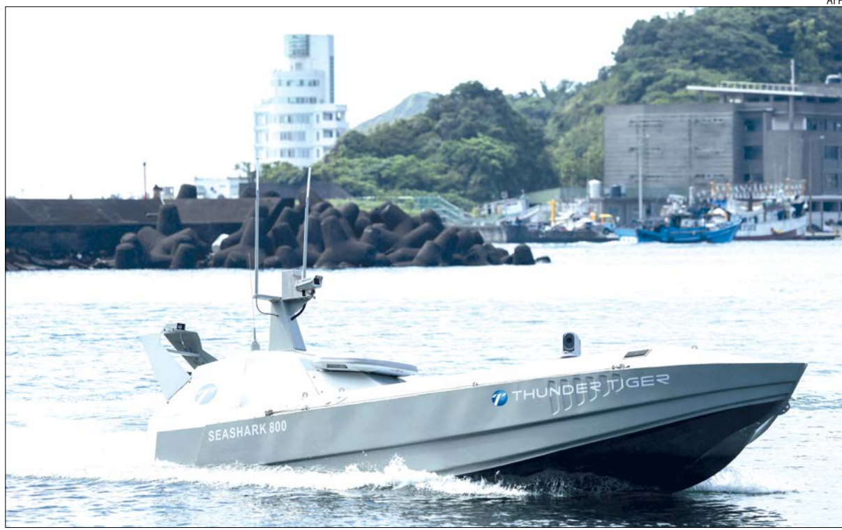
SeaShark 800 sea drone, developed by Thunder Tiger company, demonstrates its capabilities during an event held by the National Chung-Shan Institute of Science and Technology (NCSIST) at Suao Harbour, in Yilan