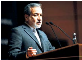
Iran's foreign minister, Abbas Araghchi, speaks during a press conference at the 51st session of the Council of Foreign Ministers in Istanbul