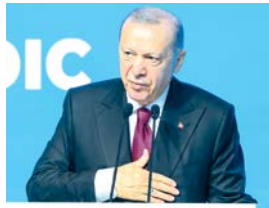
Turkey's President Recep Tayyip Erdogan speaks during the 51st session of the Council of Foreign Ministers of the Organization of Islamic Cooperation in Istanbul