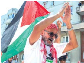
An activist from the "War on War" collective demonstrates against the presence of Israeli companies at the Paris-Le Bourget Airport, in Bobigny