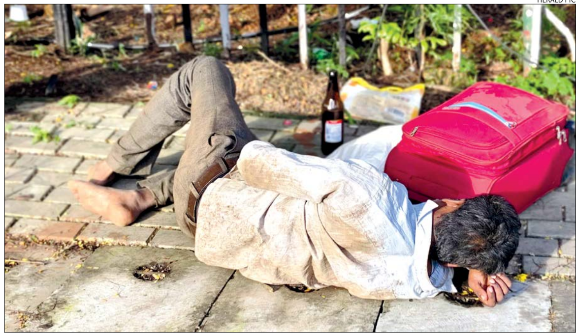
A vagrant sleeps on the pavement outside Dr Ambedkar Garden near Panjim's KTC bus stand—his suitcase and beer by his side. For many arriving in Goa's capital, this is the first glimpse of the Smart City: a reflection of the transient lives and challenges that accompany unchecked tourism and migration