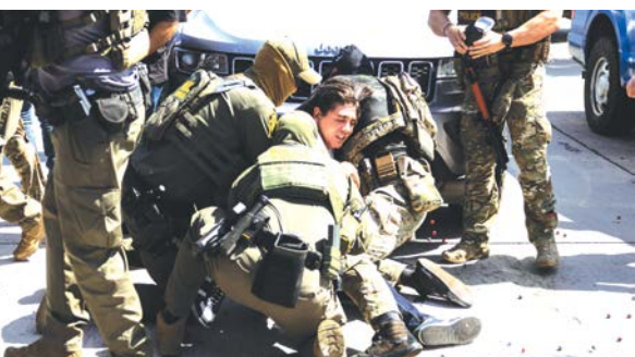
A man is detained as clashes break out after US Customs and Border Protection (CBP) officers attempted to raid a store in Bell, just south of Los Angeles, California

"Unfortunately, the soldiers and Marines are still very much a necessary part of what's going on here because they're worried that it's going to flare back up," Vance told reporters in Los Angeles. He was speaking the day after an appeals court