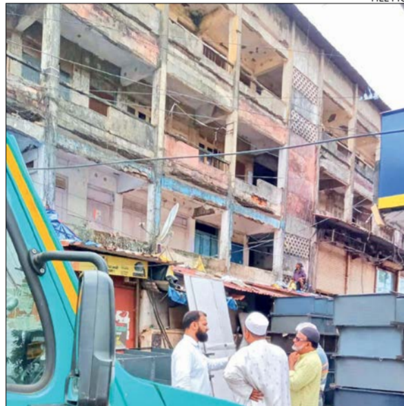
The El Dorado building located in the Panjim municipal market faces demolition