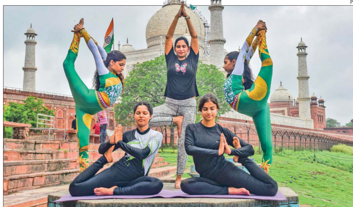
Women perform yoga at Dussehra Ghat behind the Taj Mahal, ahead of the International Day of Yoga, in Agra, Uttar Pradesh, on Friday