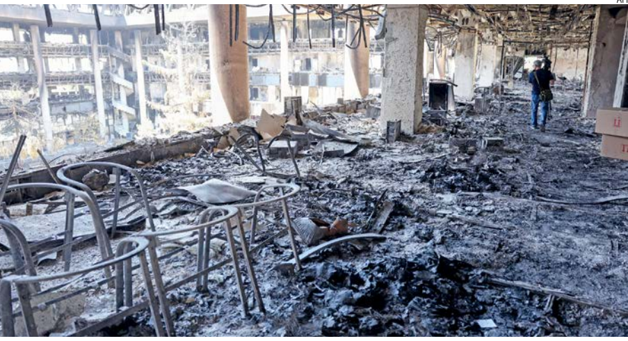
The heavily damaged building of the Islamic Republic of Iran Broadcasting (IRIB) after it was hit a few days earlier in an Israeli strike, in Tehran

on Wednesday rejected US calls for surrender in the face of more Israeli strikes and warned that any military involvement by the Americans would cause "irreparable damage to them." European diplomats prepared to hold talks with Iran on Friday. The second public ap-