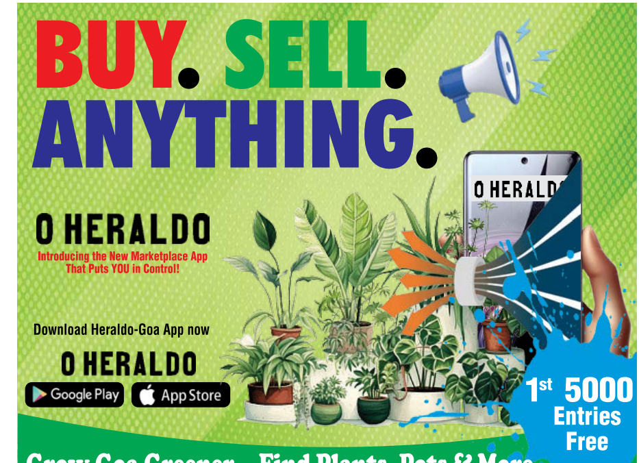
Grow Goa Greener - Find Plants, Pots & More on the App that Connects Gardeners!

PANJIM: The Bharatiya Janata Party (BJP) on Thursday announced its new 21-member State executive committee