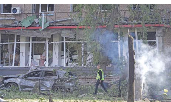
A Police officer walks past a burnt car at the site of a damaged residential building following a Russian missile and drone strike in Kyiv

It added that 16 bodies had been recovered from the rubble of a single nine-story apartment building in the Solomyansky district.