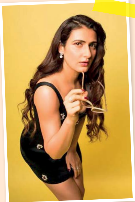
Fatima Sana Shaikh recently posted pictures from a photoshoot on Instagram, wearing a black printed mini dress, with the caption: "Madhumakhi ke sauteli behen hoon main." She will be seen in the upcoming film 'Metro... In Dino', opposite Ali Fazal