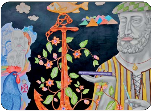
CELEBRATING LUÍS DE CAMÕES: GOAN ARTISTS PAY TRIBUTE THROUGH ART AND POETRY