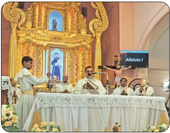
FEAST OF ST ANTHONY CELEBRATED AT ST ANTHONY CHAPEL, DEUSSUA