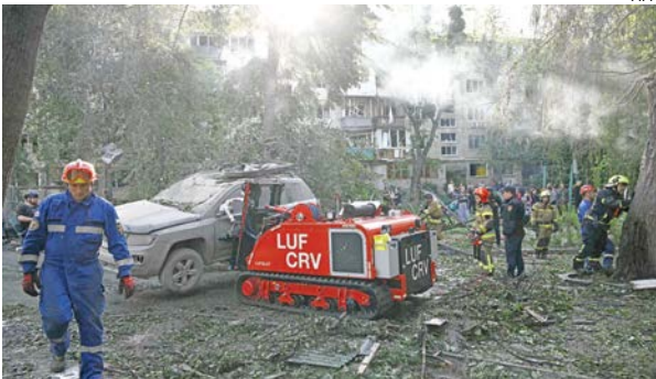
Ukrainian rescuers conduct a search and rescue work in a heavily damaged residential building following the Russian missile strike in Kyiv

AP, KYIV: An overnight Russian missile and drone bombardment of Ukraine killed 15 people and injured 156, local officials said Tuesday, with the main barrage demolishing a nine-story Kyiv apartment building in the deadliest attack on the capital this year. At least 14 people were killed as explosions echoed across the Ukrainian capital for almost nine hours, Kyiv City Military Administration head Tymur Tkachenko said, destroying dozens of apartments. Russia fired more than 440 drones and 32 missiles, Ukrainian President Volodymyr Zelenskyy said, calling the Kyiv attack "one of the most terrifying strikes" on the capital. Ukraine's Interior Ministry said 139 people were injured in Kyiv. Mayor Vitalii Klitschko announced that Wednesday would be an official day of mourning. The attack came after two rounds of direct peace talks failed to make progress on ending the war, now in its fourth year. Russia has repeatedly