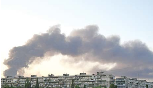
A plume of smoke rises behind residential buildings following the Russian missile and drone strike in Kyiv

hit civilian areas of Ukraine with missiles and drones. The attacks have killed more than 12,000 Ukrain-