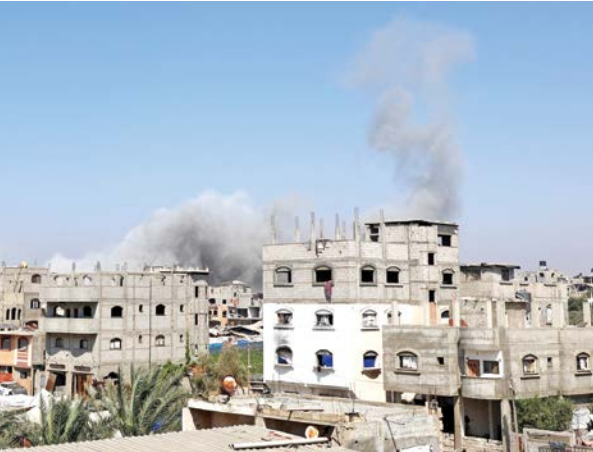
Smoke billows in Al-Bureij camp in the central Gaza Strip after the area was targeted by an Israeli strike

AP, KHAN YOUNIS (GAZA STRIP): At least 45 Palestinians were killed in the Gaza Strip while waiting for UN and commercial trucks to enter the territory with desperately needed food, according to Gaza's Health Ministry and a local hospital. The circumstances of the killings were not immediately clear. It did not appear to be related to a new Israeli- and US-supported aid delivery network that rolled out last month and has been marred by controversy and violence. Palestinians say Israeli forces have repeatedly opened fire on crowds trying to reach food distribution points run by a separate US and Israeli-backed aid group since the centres opened last month. Local health officials say scores have been killed and hundreds wounded. In those instances, the Israeli military has acknowledged firing warning shots at people it said had