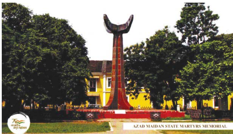
MARTYRS MEMORIALS OF GOA

Date: The last date for submission of the applications duly filled in, along with the Xerox copy of the birth certificate is June 19 up to 4 pm