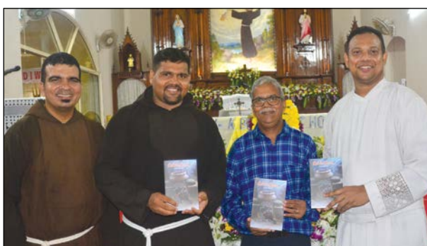
solemn mass, followed by the Trezena and blessing with the relic of St Anthony.