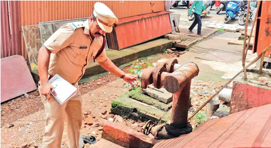
Fire Department officials inspecting the infrastructure at the Panjim market, on Monday

EIGHT YEARS ON, PANJIM MARKET FIRE HYDRANTS STILL DEFUNCT