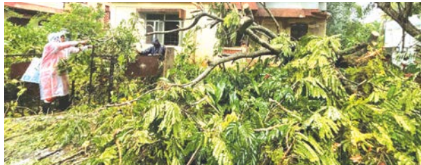
A tree that fell following heavy downpour in Margao

Salcete taluka too was impacted by heavy rains and strong winds, resulting in trees falling at multiple locations and causing losses estimated in lakhs