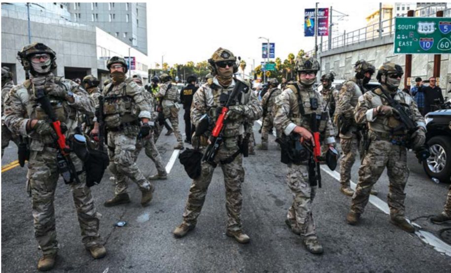
US Customs and Border Protection agents hold less-lethal weapons in front of the Metropolitan Detention Center during ongoing demonstrations in response to federal immigration operations in downtown Los Angeles

Los Angeles County Sheriff Robert Luna, whose deputies are part of a large law enforcement response in the enormous city, urged protesters to behave properly. "It's a good cause, but we do not want violent agitators out there destroying property or committing acts of violence," he said. Mayor Karen Bass said demonstrations are expected to be "even larger because of what has happened in our city."