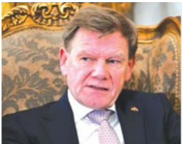
Germany's Foreign Minister Johann Wadephul looks on during his meeting with Egypt's Foreign Minister at the Foreign Ministry headquarters in Tahrir Palace