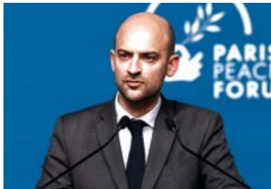
France's Minister for Europe and Foreign Affairs Jean-Noel Barrot during a conference "Paris Call for the Two-State Solution in Paris