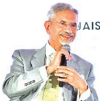
External Affairs Minister S. Jaishankar during a session at the Raisina Mediterranean 2025 conference, in Marseille, France