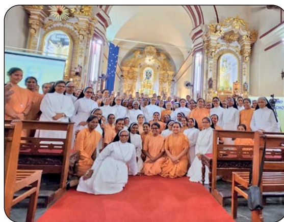
HOLY FAMILY SISTERS CELEBRATING 90 YEARS OF GRACE

In 'Dilwale Dulhania Le Jayenge', Anupam Kher's Dharamvir Malhotra stands apart in a film rich with dramatic traditions. While other parents in the film wield control, Dharamvir chooses a different path with laughter, encouragement, and open-mindedness. Living in London yet deeply connected to India, he bridges two worlds with ease and grace. For Raj (Shah Rukh Khan), his father is more than just a parent, he's a friend, a mentor, and a constant source of inspiration. Dharamvir encourages Raj to chase his dreams, travel the world, and fight for love with honour. His parenting isn't rigid; it's rooted in trust and light-hearted wisdom. In a film where patriarchal pressure often prevails, Dharamvir brings warmth and levity, reminding one that not all great fathers roar. His legacy is a reminder that support doesn't always need to be loud to be powerful.