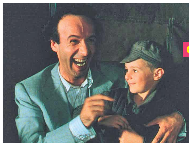
GUIDO – LIFE IS BEAUTIFUL

Roberto Benigni's Guido, the heart of 'Life is Beautiful', redefines what it means to protect a child, not just physically, but emotionally. As he, a Jewish-Italian man and his young son are sent to a Nazi concentration camp, Guido faces horrors no parent should endure. Yet, rather than let fear break their bond, he transforms their bleak reality into an elaborate game. To shield his son from the trauma, Guido pretends the camp is a contest, with a tank as the grand prize. Through humour and imagination, he gives his son a world where innocence survives. His joy is a shield, a sacrifice, a father's final gift. Even in death, Guido's love echoes in his son's smile, the one thing the world could not take. This portrayal is a masterclass in emotional resilience, proving that even when stripped of everything, a father's love can remain, beautiful, selfless, and unforgettable.