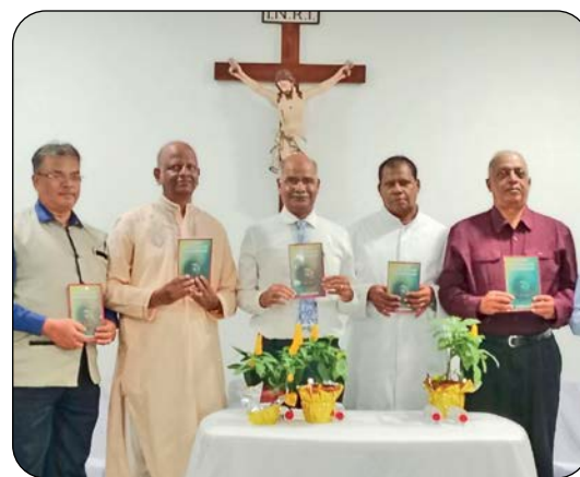
'SATVIK VICHEARANCHI EK GANTHONN' RELEASED AT VELSÃO