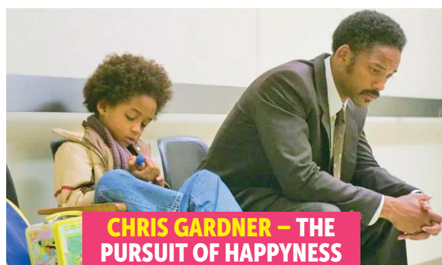
CHRIS GARDNER – THE PURSUIT OF HAPPYNESS

Marlin, the overprotective clownfish from 'Finding Nemo', represents every parent who's loved so fiercely that fear starts to guide them. After losing his wife and children in a tragic accident, Marlin becomes emotionally tethered to his only surviving son, Nemo. He hovers, questions, and even panics over the idea of letting Nemo swim beyond the reef. But the beauty of 'Finding Nemo' lies in Marlin's emotional evolution. As he embarks on an epic journey to rescue Nemo, he discovers not just courage, but the importance of trust, both in himself and his son. Along the way, he learns that parenting isn't about shielding a child from the world, but helping them face it. His reunion with Nemo is physical and an emotional closure. Marlin's love is unwavering, but his greatest gift is learning to let that love evolve into faith in his child's own strength.