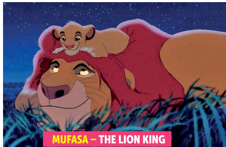
MUFASA – THE LION KING

Roberto Benigni's Guido, the heart of 'Life is Beautiful', redefines what it means to protect a child, not just physically, but emotionally. As he, a Jewish-Italian man and his young son are sent to a Nazi concentration camp, Guido faces horrors no parent should endure. Yet, rather than let fear break their bond, he transforms their bleak reality into an elaborate game. To shield his son from the trauma, Guido pretends the camp is a contest, with a tank as the grand prize. Through humour and imagination, he gives his son a world where innocence survives. His joy is a shield, a sacrifice, a father's final gift. Even in death, Guido's love echoes in his son's smile, the one thing the world could not take. This portrayal is a masterclass in emotional resilience, proving that even when stripped of everything, a father's love can remain, beautiful, selfless, and unforgettable.