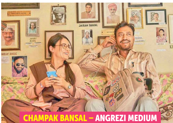
CHAMPAK BANSAL – ANGREZI MEDIUM

Mufasa, the majestic lion from 'The Lion King', isn't just a ruler, he's the personification of fatherhood at its finest. With Simba, Mufasa is patient, authoritative, and deeply loving. He introduces his son to life's complexities not through fear, but through wisdom and emotional strength. When Simba disobeys, Mufasa doesn't resort to anger. Instead, he expresses his fear and concern by saying, "I was afraid I might lose you," a line that beautifully reflects a father's vulnerability. In one of the film's most moving scenes, Mufasa sacrifices his life to save Simba, showing that love often means putting one's child first, even at great cost. His legacy lives on in Simba's heart, reminding us that a father's lessons can transcend life itself. Mufasa teaches that strength lies not just in power, but in love, humility, and the courage to guide with tenderness instead of control.