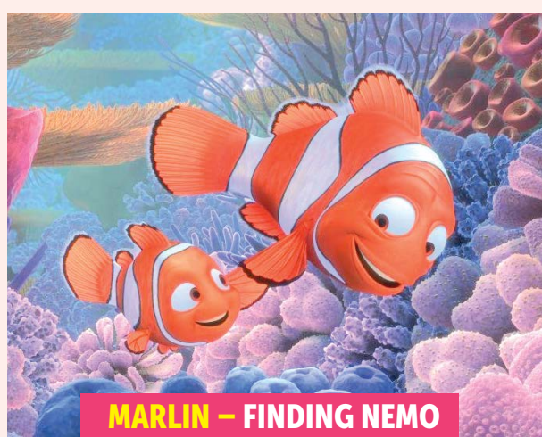
MARLIN – FINDING NEMO

Marlin, the overprotective clownfish from 'Finding Nemo', represents every parent who's loved so fiercely that fear starts to guide them. After losing his wife and children in a tragic accident, Marlin becomes emotionally tethered to his only surviving son, Nemo. He hovers, questions, and even panics over the idea of letting Nemo swim beyond the reef. But the beauty of 'Finding Nemo' lies in Marlin's emotional evolution. As he embarks on an epic journey to rescue Nemo, he discovers not just courage, but the importance of trust, both in himself and his son. Along the way, he learns that parenting isn't about shielding a child from the world, but helping them face it. His reunion with Nemo is physical and an emotional closure. Marlin's love is unwavering, but his greatest gift is learning to let that love evolve into faith in his child's own strength.