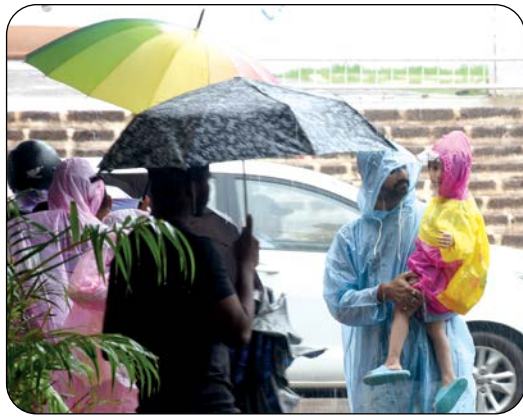
BOATS, PUDDLES, & FORGOTTEN JOYS: MONSOONS AND THE LOST CHILDHOOD