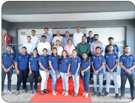
VIDYA PRABODHINI COLLEGE HOSTS 'GETTING INDUSTRY READY' PROGRAMME