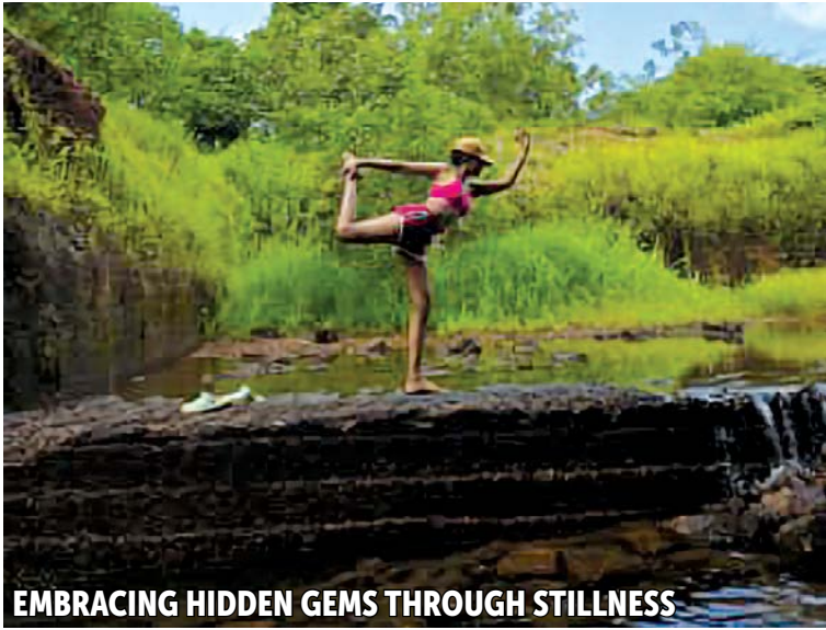
EMBRACING HIDDEN GEMS THROUGH STILLNESS

And for those who once relied on a rigid checklist, slow travel offers something far more valuable: discovery through spontaneity.