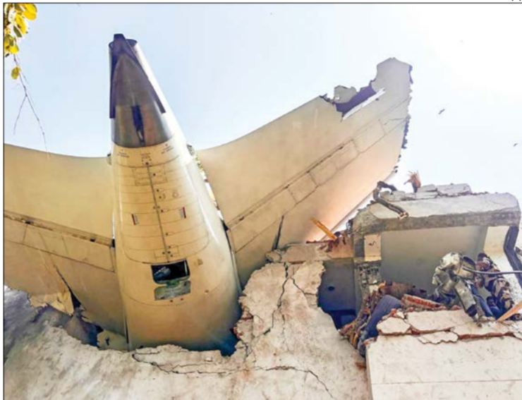
The tail section of the plane that crashed into a building at Ahmedabad