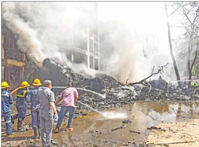
Fire and Emergency Services personnel at work at the crash site in Ahmedabad

Four MBBS students and a doctor's wife were among those killed, a senior official said. Several students were impacted after parts of the plane smashed into a dining hall at lunch time