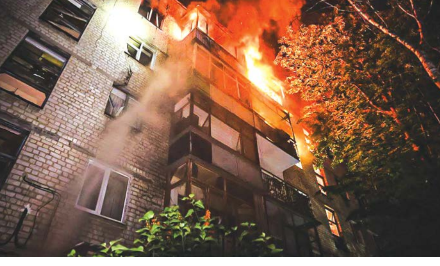
A burning building following a drone attack in Kharkiv, amid the Russian invasion of Ukraine