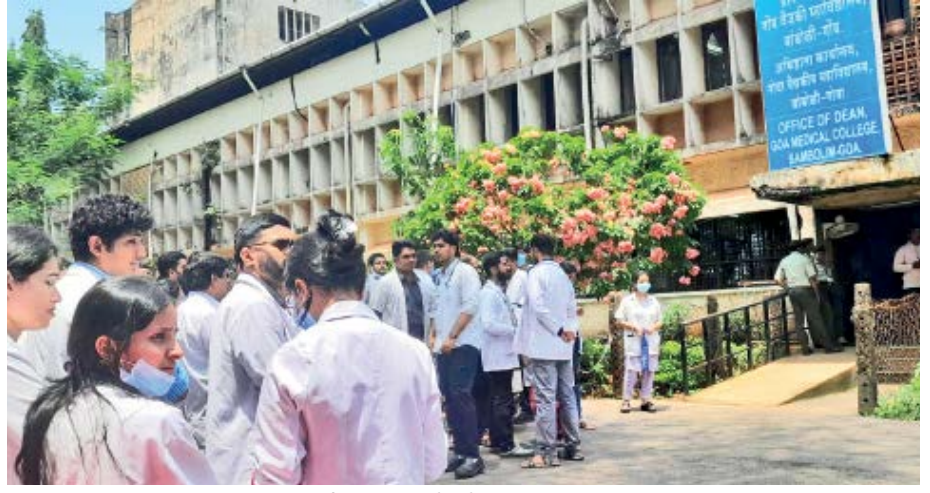
Agitating doctors outside the dean's office at GMC, Bamblim, on Tuesday

CM agrees to medics' demands; MOU signed in his presence