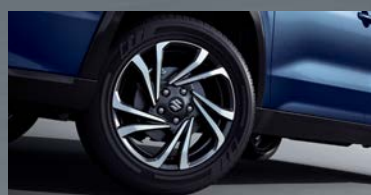
R17 MACHINED ALLOY WHEELS