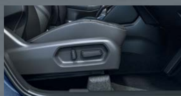
8-WAY DRIVER POWERED SEAT