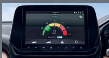
AUTO PURIFY WITH PM2.5 DISPLAY