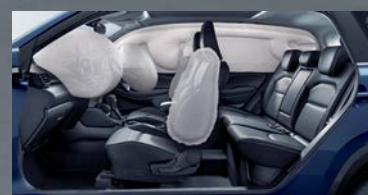
6 AIRBAGS AS STANDARD

3 years 100 000 km WARRANTY* EXTENDABLE UPTO 6 YEARS