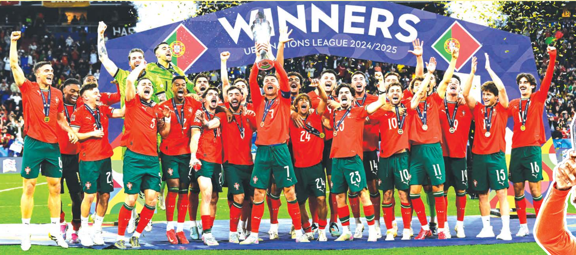
Portugal team celebrates after winning the Nations League final soccer match against Spain at the Allianz Arena in Munich, Germany

er Diogo Costa in the 45th after Pedri played him in.