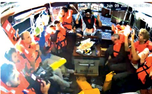
Activists on board the Gaza-bound aid boat Madleen, with their hands in the air, as they are being intercepted by the Israeli forces in international

AFP, JERUSALEM, UNDE-FINED: Israeli forces intercepted a Gaza-bound aid boat on Monday, preventing the activists on board -- including Swedish campaigner Greta Thunberg -- from reaching the blockaded Palestinian territory. The Madleen set sail from Italy on June 1 to raise awareness of food shortages in Gaza, which the United Nations has called the "hungriest place on Earth". After 21 months of war, the UN warns the entire population is at risk of famine. At around 4:02 am (0102 GMT), Israeli troops "forcibly intercepted" the vessel in international waters as it approached Gaza, the Freedom Flotilla Coalition said. "If you see this video, we have been intercepted and kidnapped in international waters," Thunberg said in pre-recorded footage shared by the coalition. Video from the group shows the activists with their hands up as Israeli forces boarded the vessel, with one of them saying nobody was injured prior to the interception. Israel's foreign ministry, in a post on social media, said "all the passengers of the 'selfie yacht' are safe and unharmed", adding it expected the activists to return to their home countries. Turkey condemned the interception as a "heinous attack" in international waters. Iran also denounced it as "a form of piracy", citing the same grounds. In May, another Freedom Flotilla ship, the Conscience, reported it was struck by drones in an attack the group blamed on Israel. In 2010, a commando raid on the Turkish ship