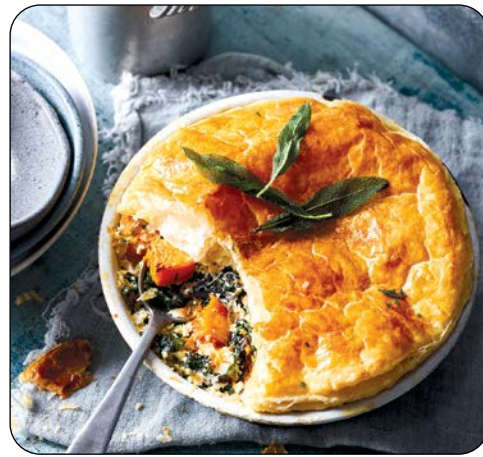
FIVE SAVOURY VEGGIE DELIGHTS WORTH THE CRUST