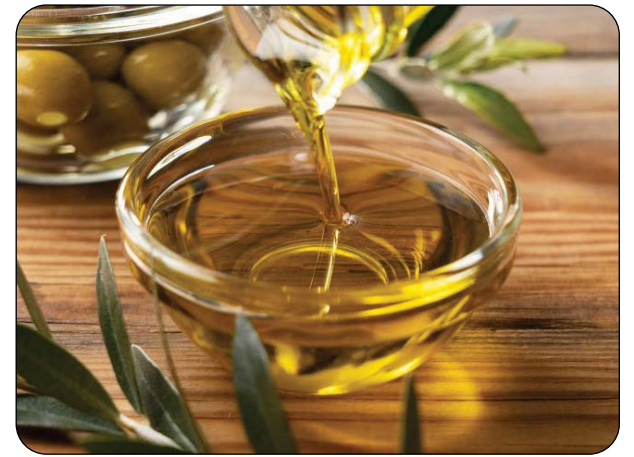
OLIVE OIL VS OLIVE POMACE OIL: TRADE-OFFS AND MORE