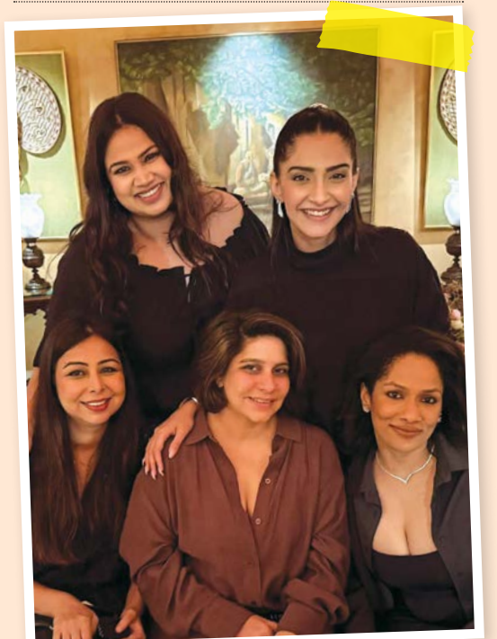
Sonam Kapoor Ahuja celebrates her 40th birthday with an intimate gathering at home, surrounded by close family and friends.